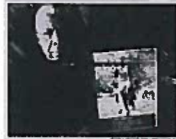
© John Woodruff shared always a photograph of his winning in the 400-meter race in the 1936 Olympic Games. Woodruff is the lone surviving gold medalist from the 1936 U.S. team's triumph. The shot on Woodruff's Super League photo is from the Track & Field Hall of Fame.

Through good and bad, 1936 U.S. gold medalist John Woodruff has never lost faith in his country